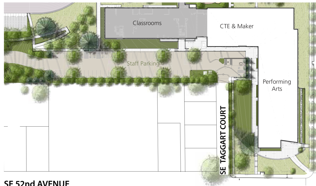
SE 52nd AVENUE